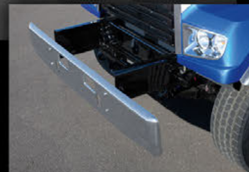
12" or 24" front frame extensions are available.