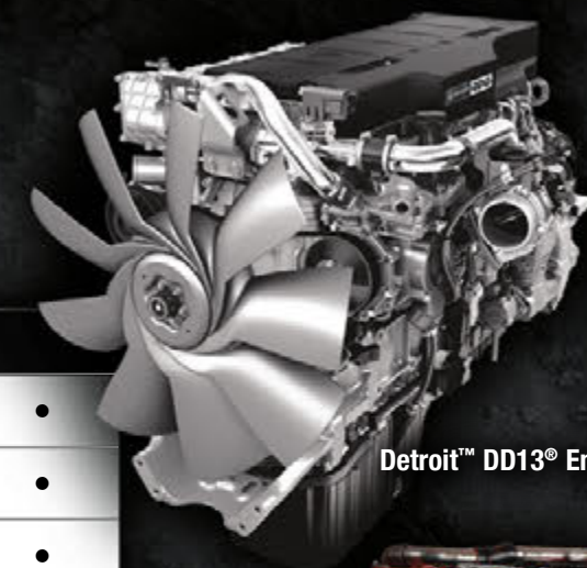
Detroit™ DD13 ® Engine