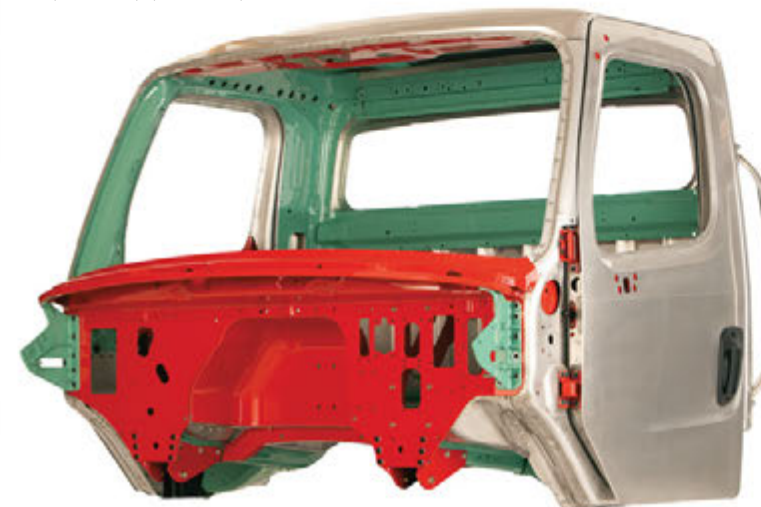
■ Aluminum Structural Reinforcements ■ E-coated Steel Reinforcements ■ Corrosion-resistant Aluminum Panels

We've applied sophisticated engineering to the structural elements of our work trucks. First, our cabs are lightweight, yet extremely tough. Corrosion-resistant aluminum is reinforced with e-coated steel and assembled to precise manufacturing tolerances with Henrob rivets and welded construction. This process produces a durable and safe cab that meets stringent A-pillar impact, rollover and back wall impact tests. Plus, the chassis includes a robust backbone with a complete offering of single and double channel frame rails. The result is a tensile strength of up to 120,000 psi and an RBM ratio up to 4.4 million inch-pounds per rail. This means the 114SD can handle whatever job is thrown at it, day after day, year after year.