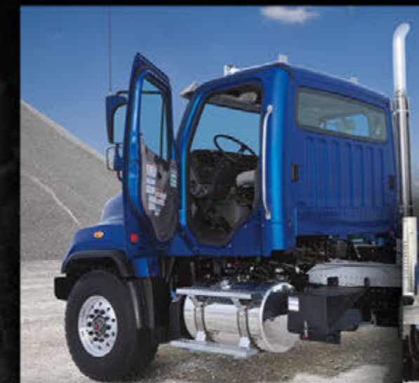
65-degree door opening for easy entry and exit.