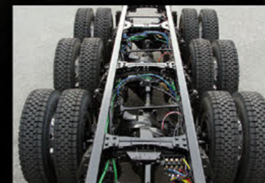
Tridem rear axles.