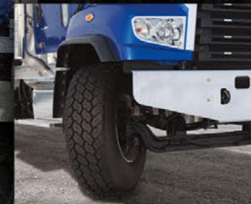
Superior wheel cut for outstanding maneuverability.