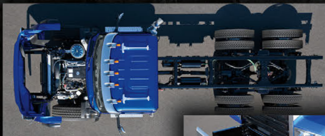
Tilt hood with radiator-mounted stationary grille for easy engine access.

• Detroit DD13 ® engine standard, optional Cummins ISC, ISL and ISL G (natural gas)