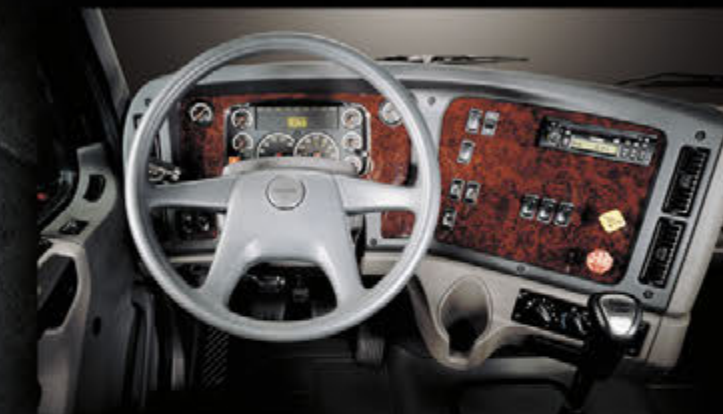
114SD standard wing dash.