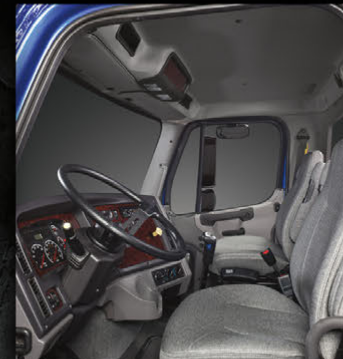
Ergonomically-designed driver's area features an automotive-style dash, easy-to-read LED-backlit gauges and controls within easy reach.